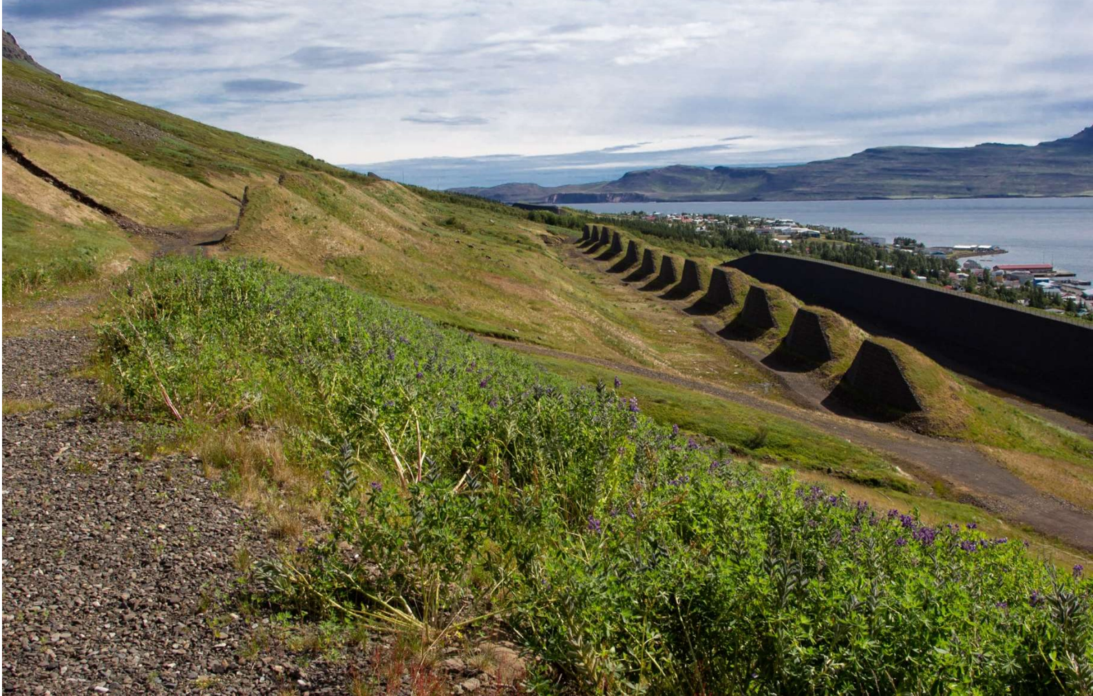
Figure 4. Neskaupstadur