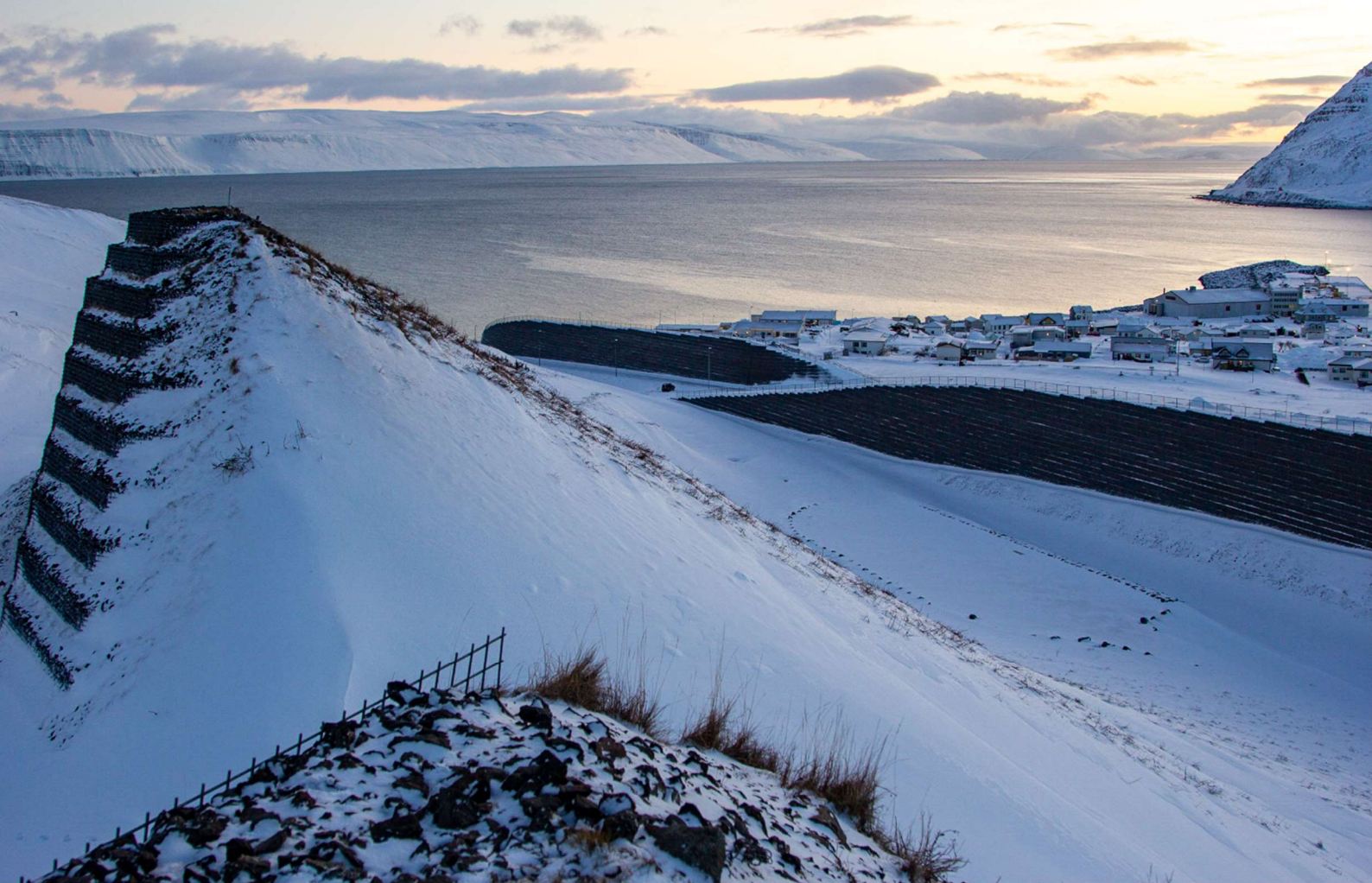
Figure 2 Bolungarvik