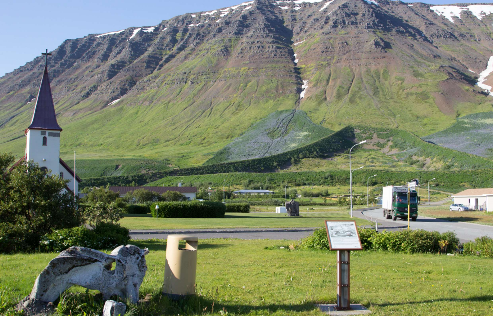
Figure 3 Flateyri